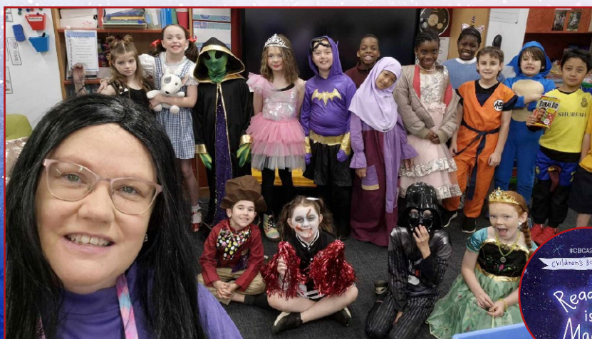
B1R4 - Book Week parade day