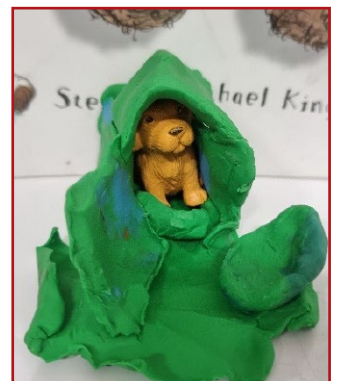
A dog in its house with a bowl of food