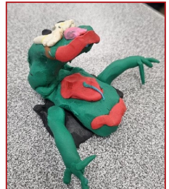
The Bunyip at Murray Bridge