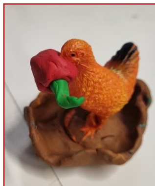
A chicken in its nest, eating a capsicum