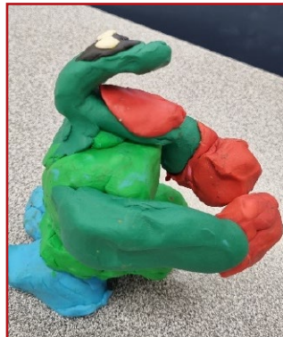
Humpty Doo's Boxing Crocodile

Ms Harris' students have been investigating the survival needs of both flora and fauna. Students chose an animal and were asked to make the shelter and a food item their animal would eat. Animals chosen by the students ranged from domestic dogs to rats and tarantulas. This gave us a wide variety of wonderful modelled creations.